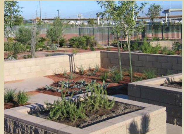
Small Yards Garden