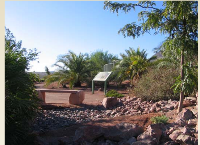
Allergy Friendly Garden