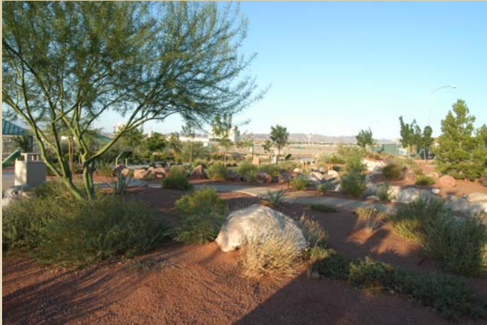
Wildlife Friendly Garden